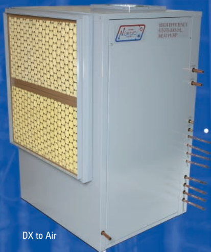
DX to Air

(W) LIQUID-TO-WATER units are intended for use on either open well systems or on closed loop systems. Available with domestic hot water desuperheaters and as either heating only or heating cooling systems. Very popular for use with concrete in-floor heating systems, swimming pool heating, or any other application where large quantities of hot water are required. Available with dual compressors (W3 system) to give 3 stages of capacity at an ultra high efficiency rate.