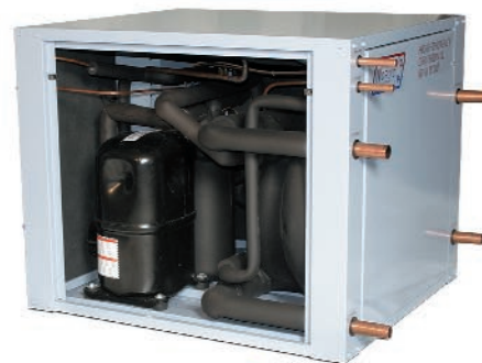
Liquid to Water

(R) REVERSIBLE SERIES ACTIVE COOLING full package units are similar in appearance to the (O) series however they offer mechanical cooling and are specifically suited to either well water or geothermal ground loops. Active cooling is required for a geothermal groundloop application due to the high loop fluid temperatures which may be encountered during summer operation. Can provide more cooling than (O) style units in the 4 and 5 HP range. Domestic hot water is available in both heating and cooling mode.