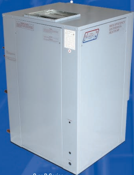
O or R Series

Nordic® heat pumps are available in the following series: